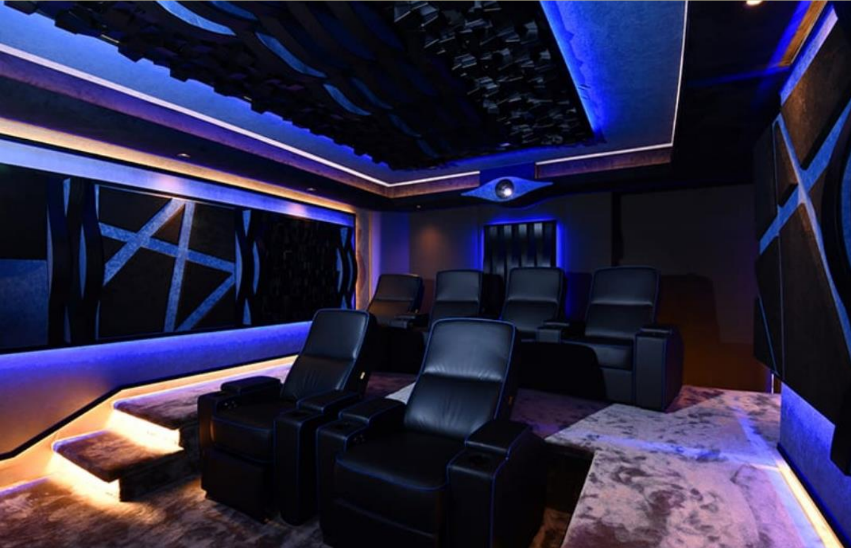
Design #24- Side/Misc Profiles