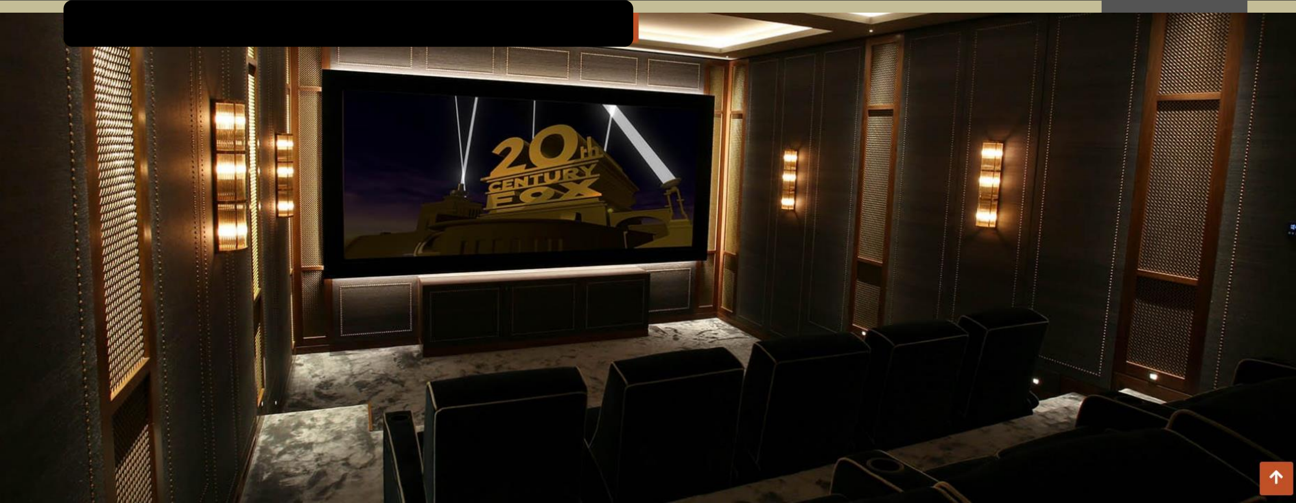
Design #41 - Ideal for Mid/Large sized rooms with 8-14 seating