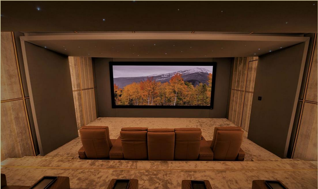
Design #8- Side/Misc Profiles