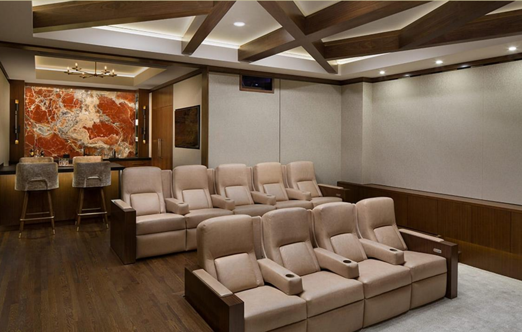
Design #119- Side/Misc Profiles