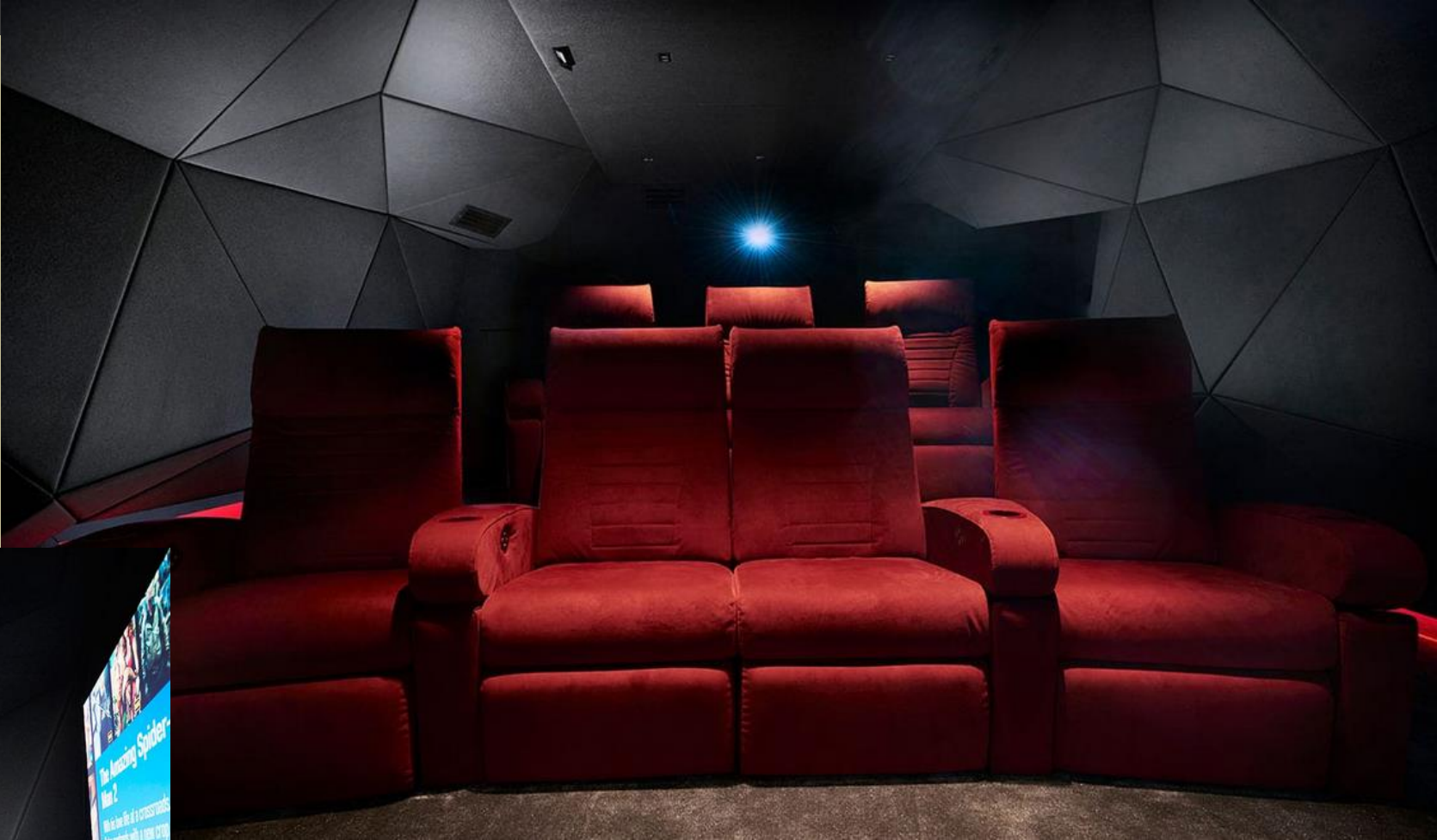
Design #90- Side/Misc Profiles