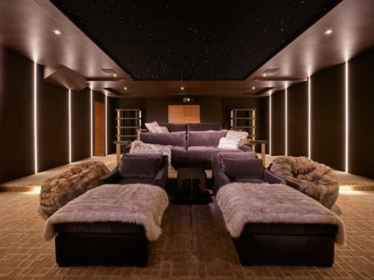
Design #2- Side profiles