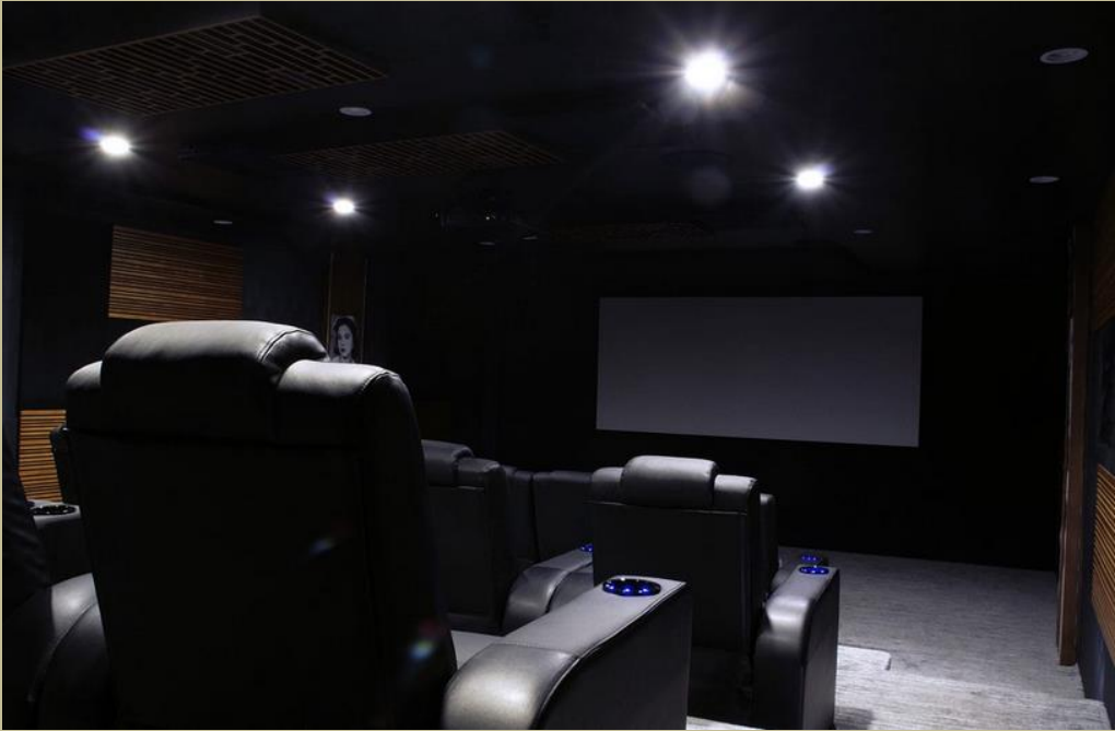
Design #4- Side/Misc Profiles