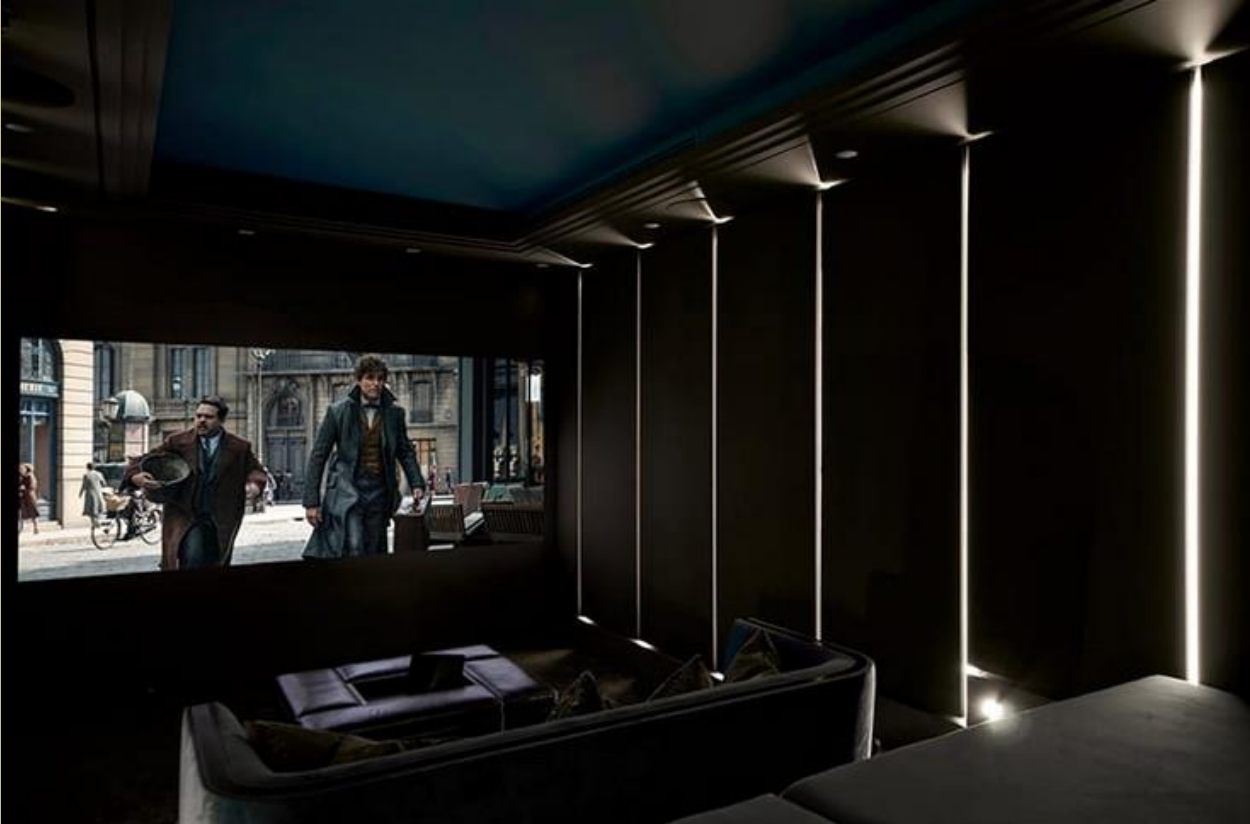
Design #1- Side/Misc Profiles