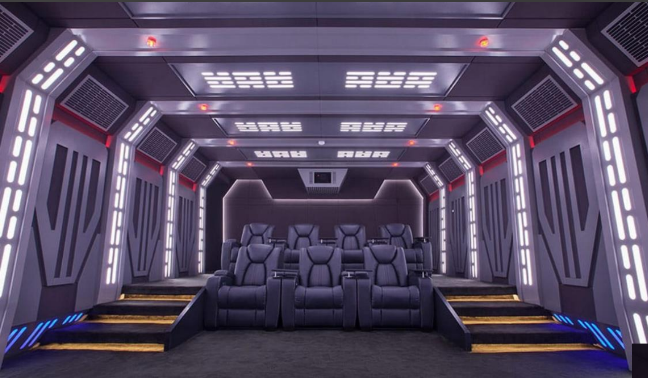
Design #92- Futuristic Theme- Side/Misc Profiles