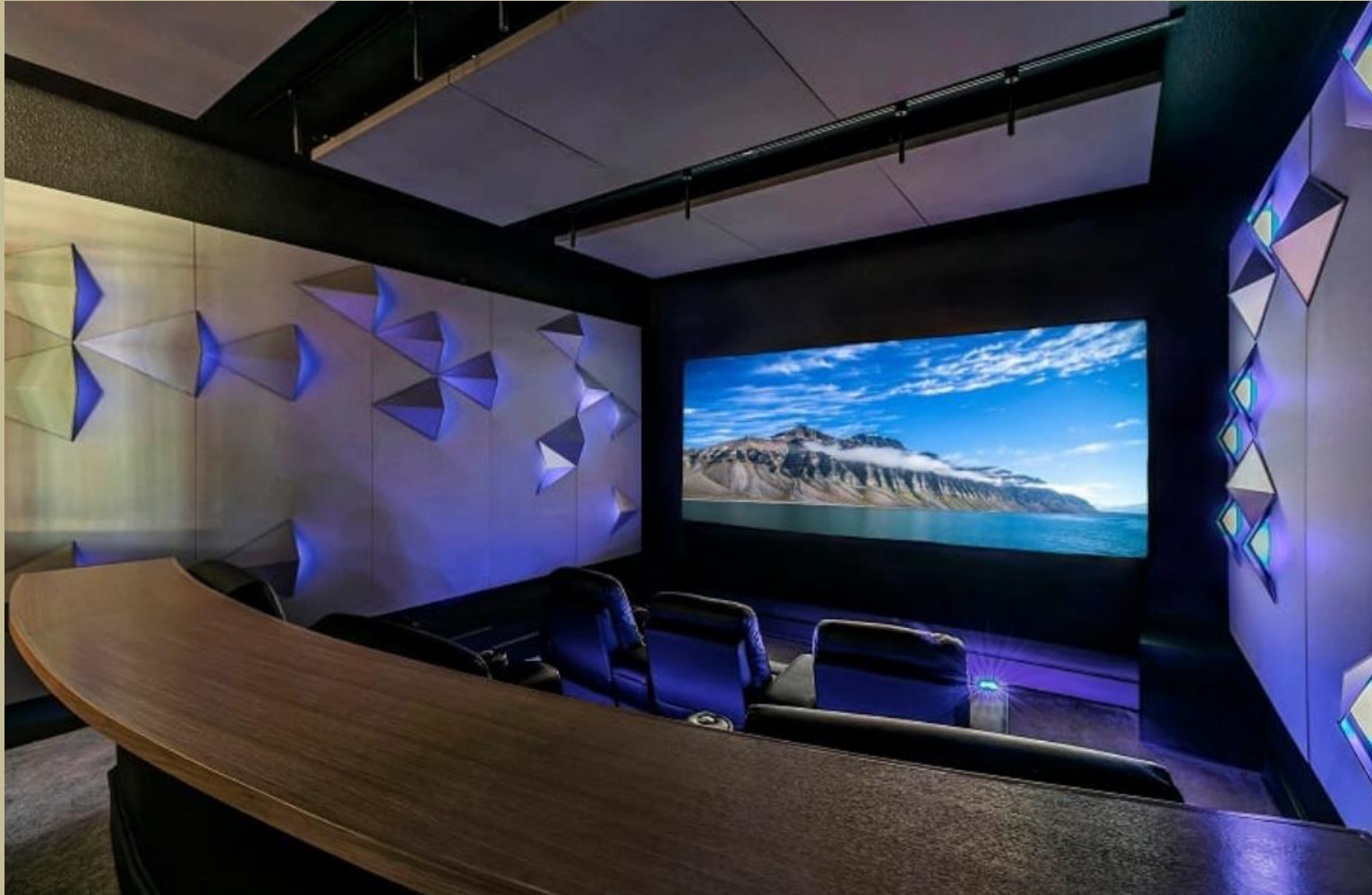
Design #193- Ideal for small/mid sized rooms with 6-10 seating, with Bar Area seating of 3-4