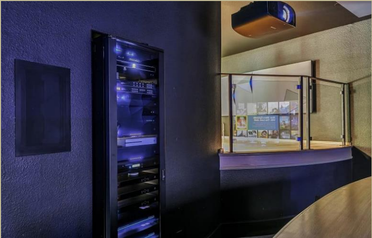
Design #193- Side/Misc Profiles