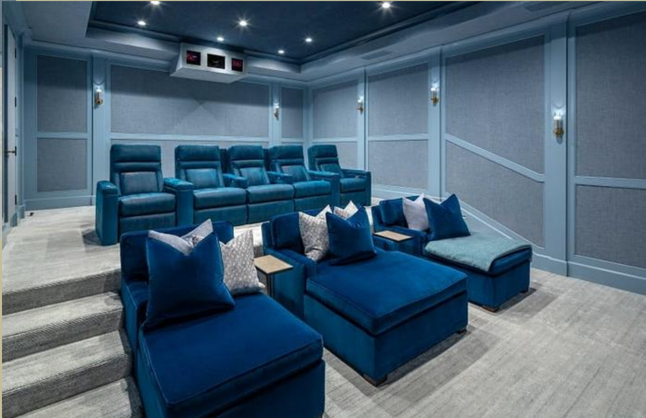
Design #99- Side/Misc Profiles