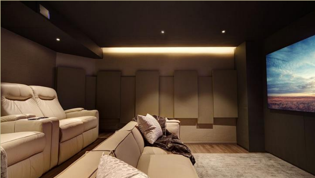
Design #67- Side/Misc Profiles