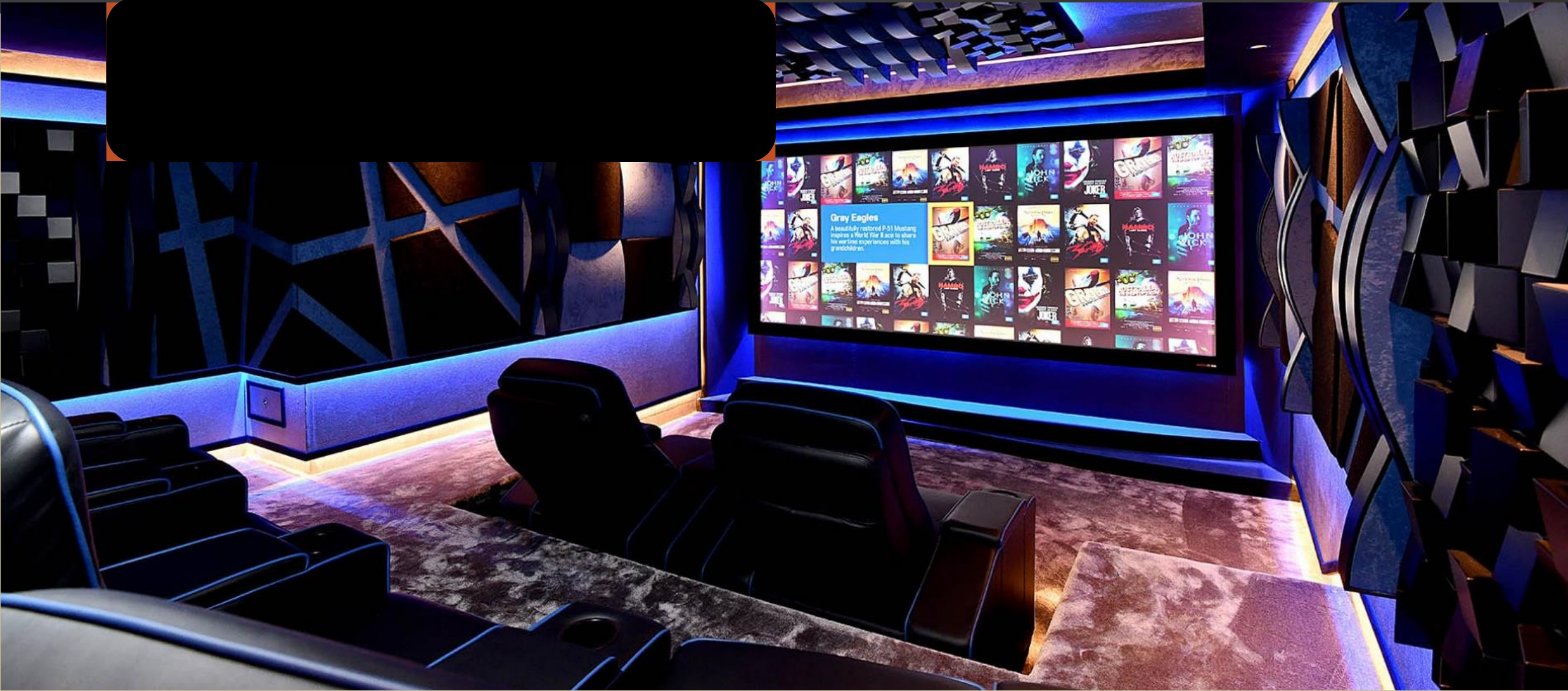
Design #24- Ideal for mid/Large sized rooms with 8-12 seating