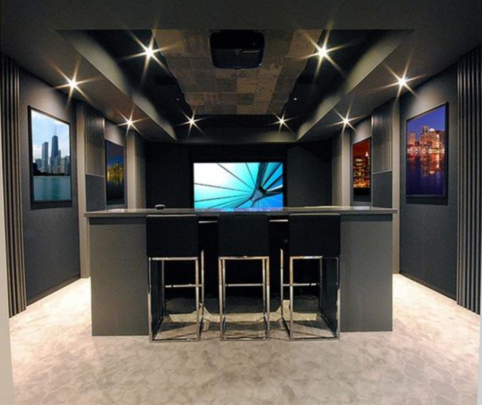
Design #198- Side/Misc Profiles