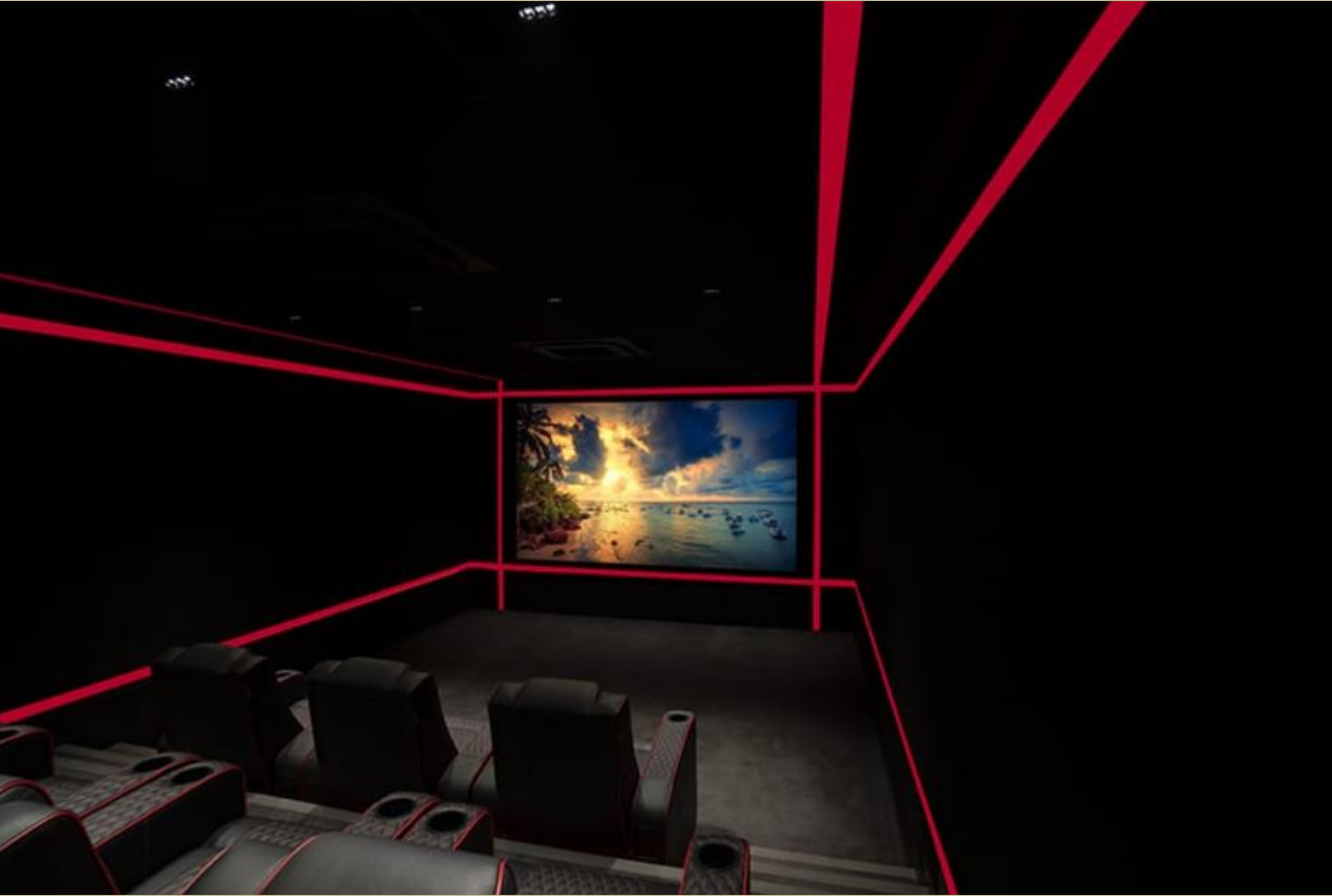
Design #6- Side/Misc Profiles