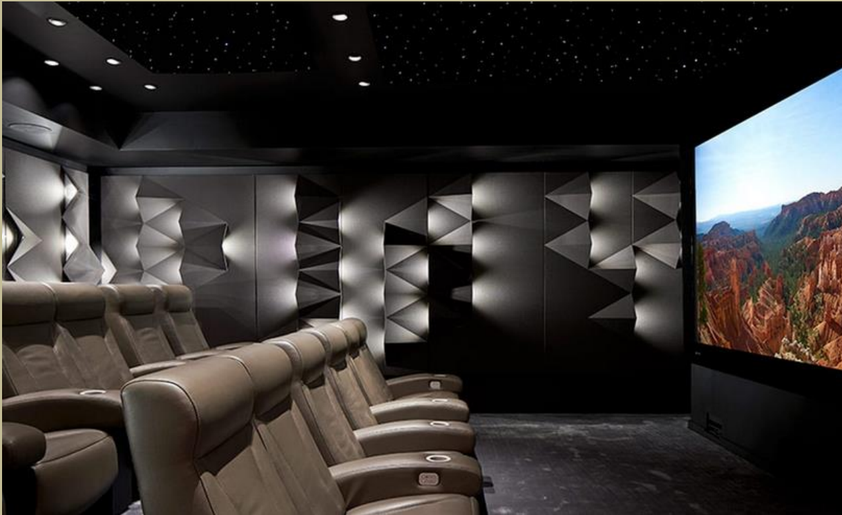
Design #21- Side/Misc Profiles