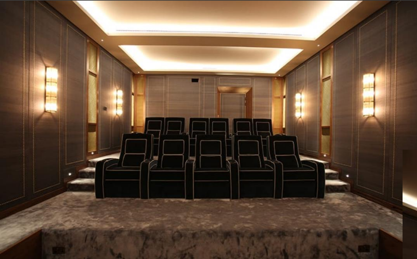
Design #41- Side/Misc Profiles