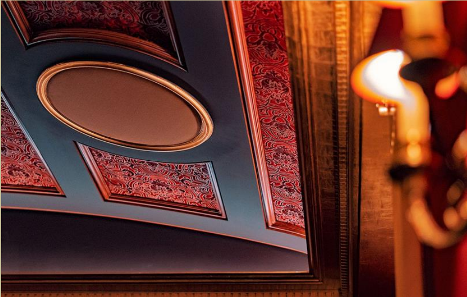
Design #17- Side/Misc Profiles