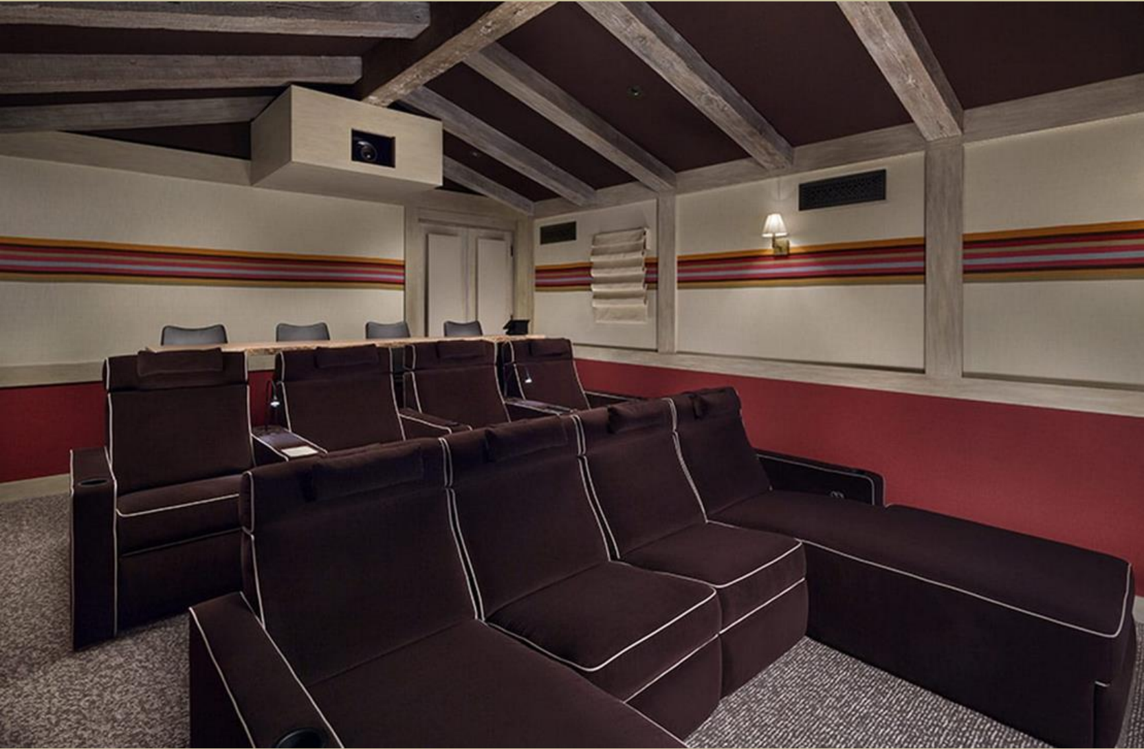
Design #88- Side/Misc Profiles