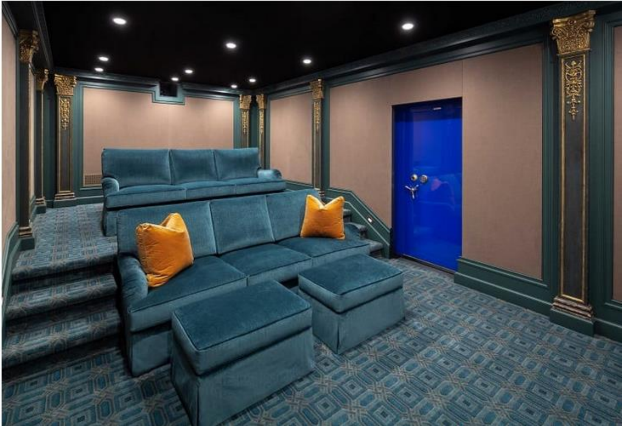
Design #55- Side/Misc Profiles