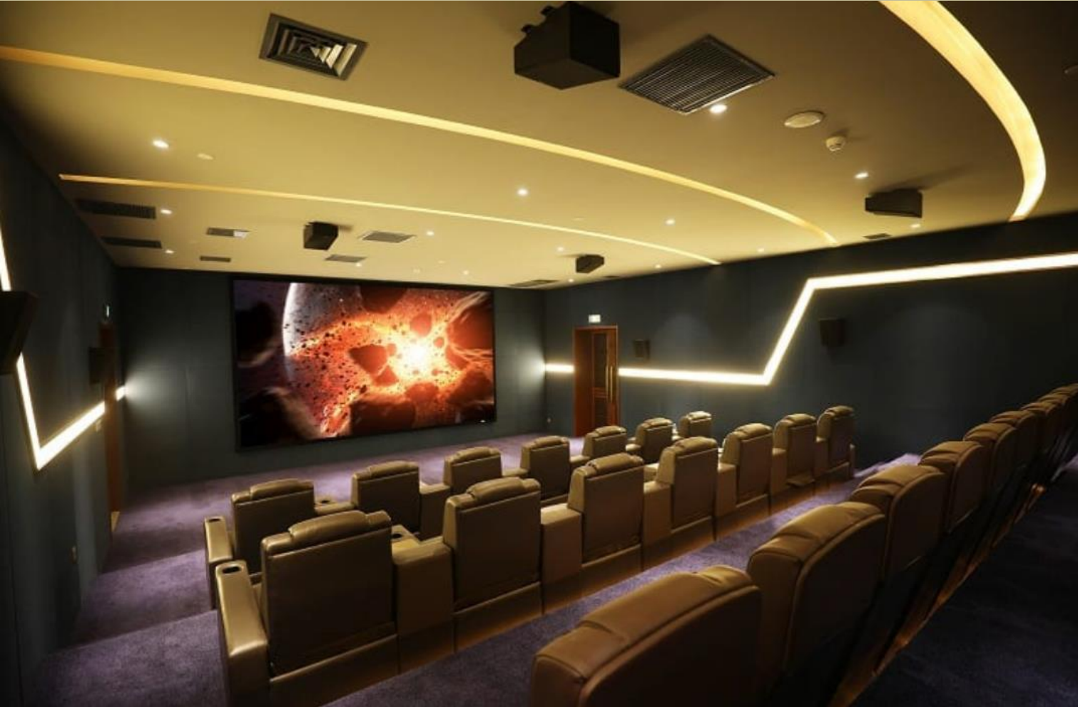
Design #36- Side/Misc Profiles